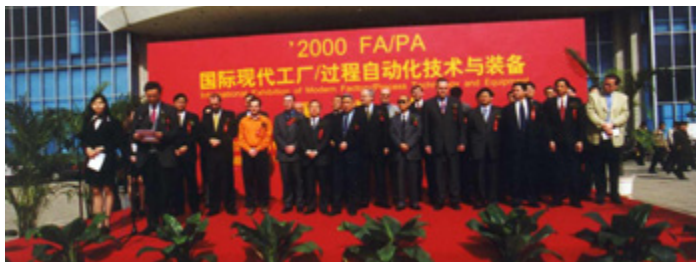
A major step forward came when the Chinese automation market opened up to PROFIBUS technology. Standardization was the key to marketplace acceptance.

The latest region to join the PI community is India. An RPA there is still in formation but the indicators described above are emerging faster than usual. Expect some interesting developments there, particularly on the device front.